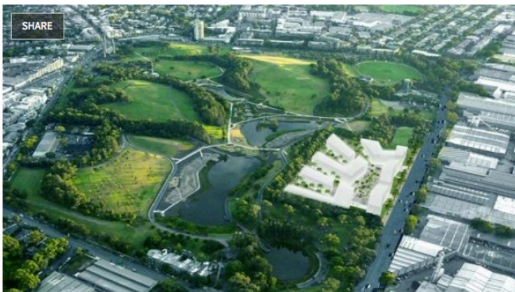
Site of the $600 million HPG residential project.

The property at 205-225 Euston Road, which houses a 7000-square-metre empty warehouse, was purchased from Goodman Group in 2015.